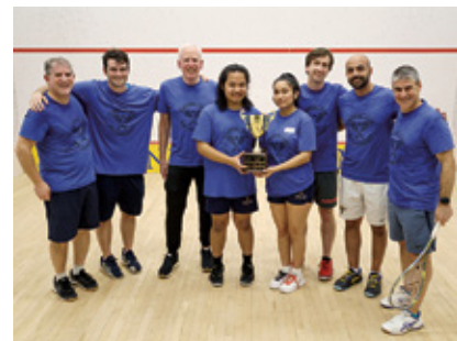
Top: Big Bow Energy made a splash at the event as the first all-women's team to compete at the Capitol Cup. The tournament had the largest number of women compete since its inception in 2014.